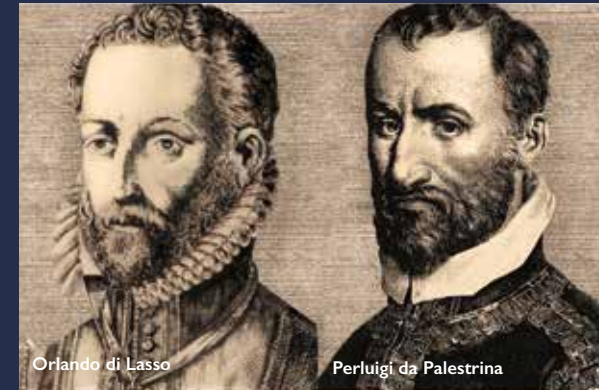
Orlando di Lasso