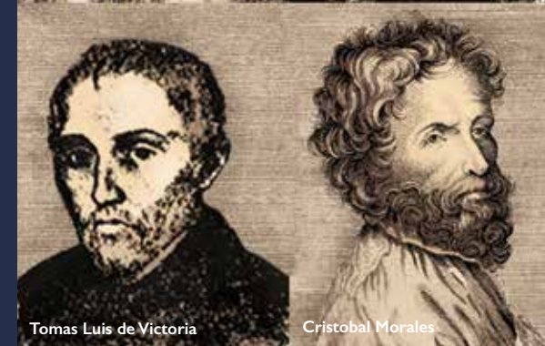
Tomas Luis de Victoria