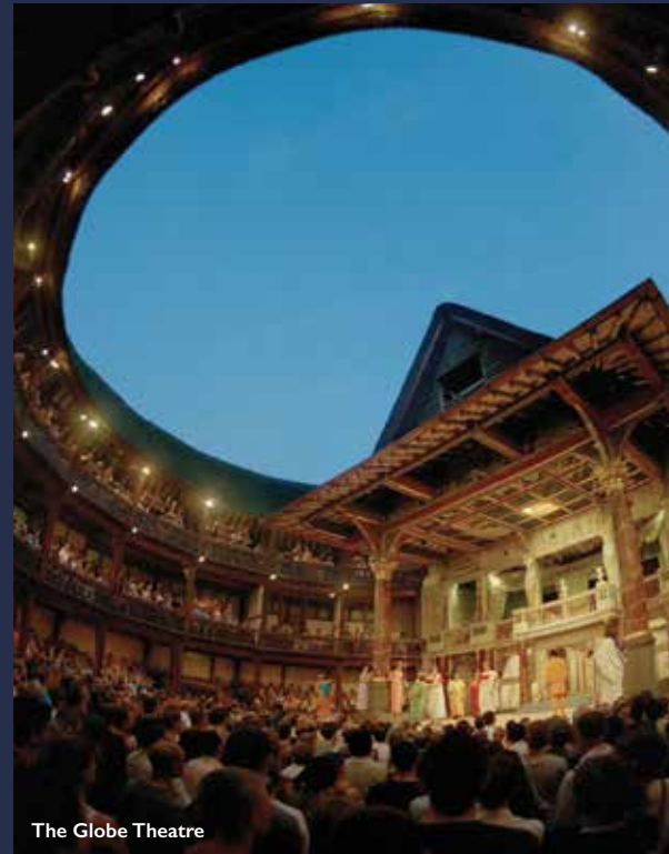
The Globe Theatre